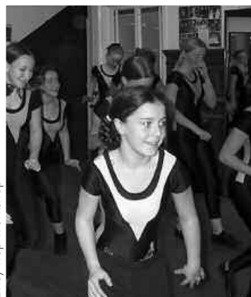
Lindy hop workshop